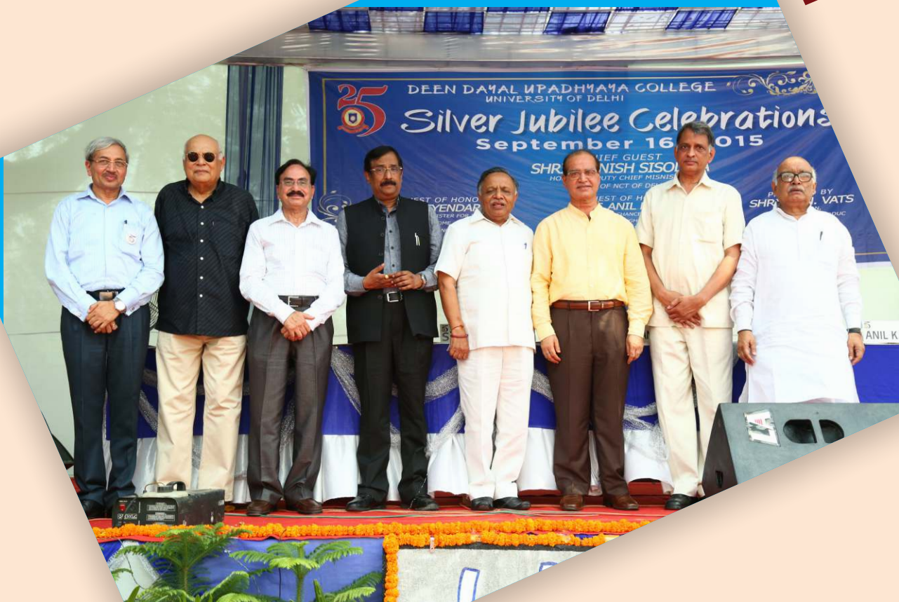
The past & present Governing Body Chairmen with Principal & Guest of Honor

“Great Vision without great people is impossible.”